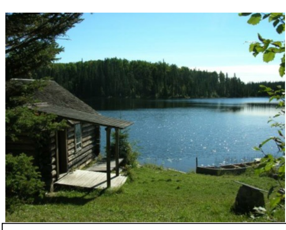
McKellar's Lodge circa 1918